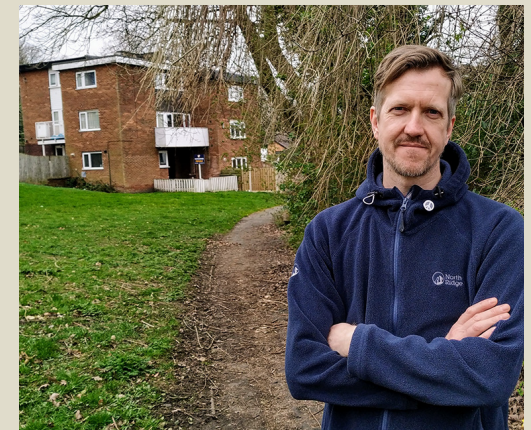
Spring Close Mount is a threatened green space

A recent Freedom of Information request shows that, despite residents being given assurances otherwise, the Labour-run council planned to demolish parts of the Gleadless Valley estate before the Masterplan consultation began.