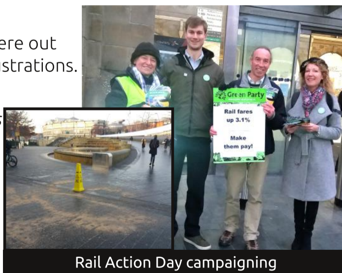
Rail Action Day campaigning

"There's something wrong if council policy says no pedestrian areas are gritted in advance, even when it's the main way in and out of the city for thousands of commuters every day."