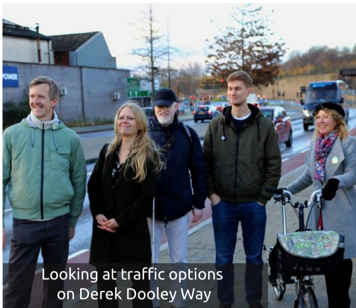
Looking at traffic options on Derek Dooley Way

If you need to claim universal credit, check out our factsheet at www.sheffieldgreenparty.org.uk/uc Or phone us.