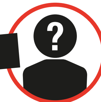
yet another Labour councillor