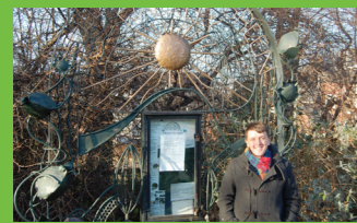
Got Millennium Park bins at Bell Hagg Rd emptied regularly.