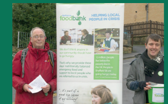
Organised regular collections for S6 Foodbank, to assist people in need.