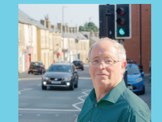
Worked with South Rd businesses to improve parking, walking & cycling arrangements.