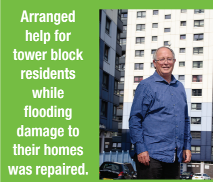
Arranged help for tower block residents while flooding damage to their homes was repaired.