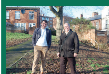
Pressed Amey to deal with overflowing drain on Springvale Estate.