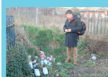
Got action to tackle fly-tipping, eg on Hammerton, Freedom & Fox Rds.