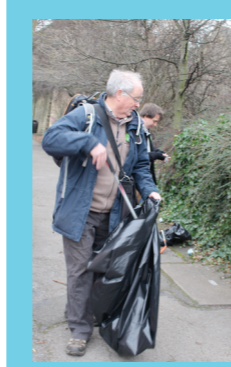
Organised litter-picks in various places, including Uppertorpe and on Orchard Rd.