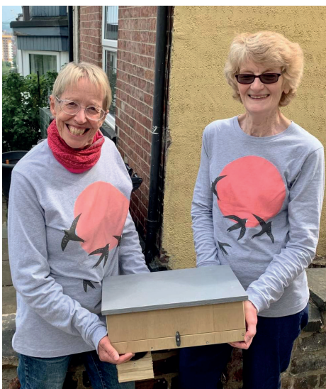
S11 Swifts group members with swift box.