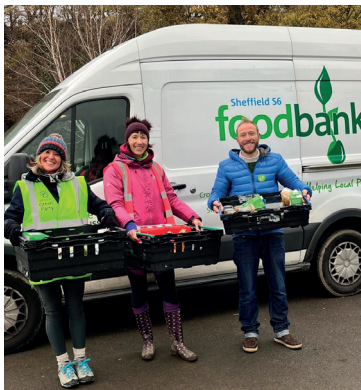
Ecclesall Greens and Endcliffe Parkrun team up for collection

Ecclesall Greens are supporting the S6 Foodbank by helping to run a new local collection on the last Saturday of the month.