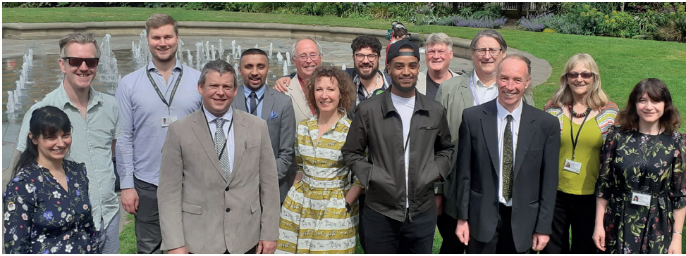
Sheffield's Green group of 14 councillors

In the last few months the Green group have made significant progress in the council, working to make Sheffield fairer, safer and more sustainable.