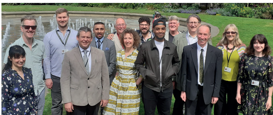
Sheffield's Green group of 14 councillors