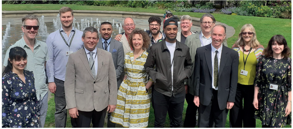
Sheffield's Green group of 14 councillors

In the last few months the Green group have made significant progress in the council, working to make Sheffield fairer, safer and more sustainable.