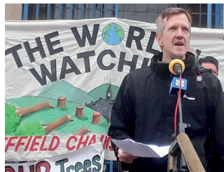
Paul was very involved in the tree protests

Green councillors secured an independent inquiry into the needless felling of healthy street trees. The report identifies "serious and sustained failure of strategic leadership" in the Labour administration at the time.