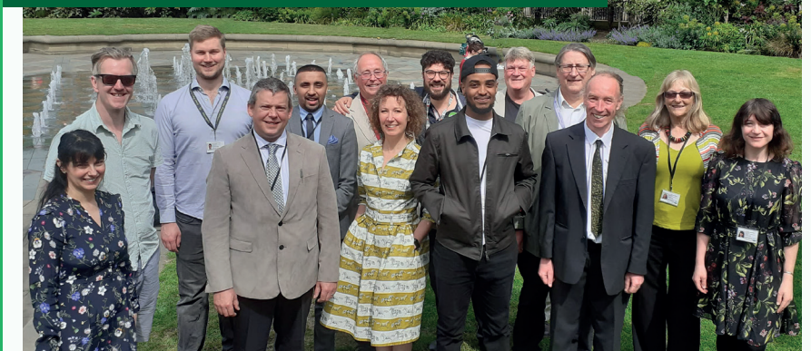
Sheffield's Green group of 14 councillors