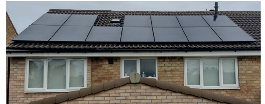
Solar panels on South facing roof in Ecclesall