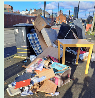
Fly-tipping on Shoreham Street