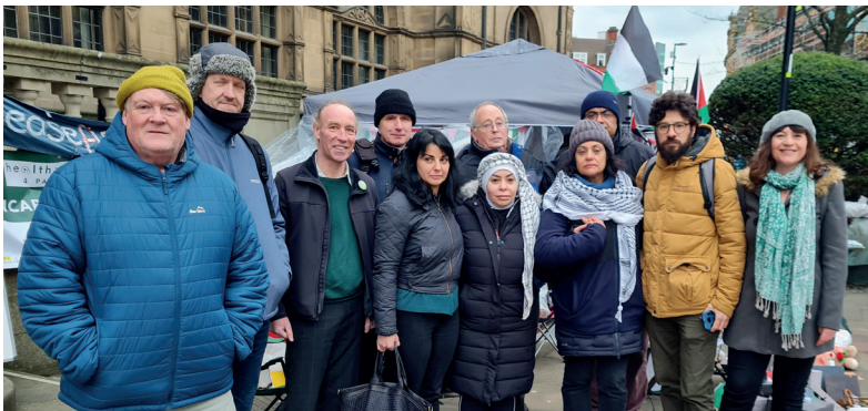
Green Councillors with campaigners outside Sheffield Town Hall

During a cold week in January, two Palestinian women camped outside the Town Hall. Their week-long campaign was to draw attention to the 2 million people in Gaza who have been displaced or killed.