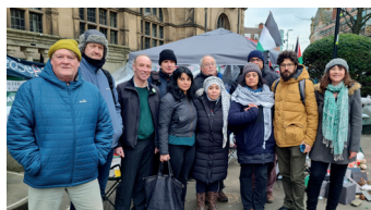
Green Councillors with campaigners outside Sheffield Town Hall

Greens have been clear and consistent in supporting humanitarian values and international law. In November 2023, the council passed a Green motion calling for a ceasefire in Gaza.