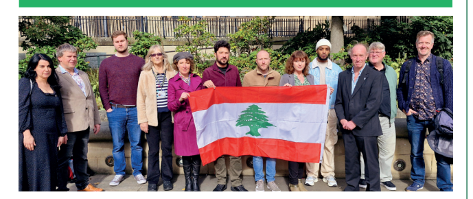
Sheffield Green Councillors with flag of Lebanon

Sheffield Green Party Councillors have condemned Israel's escalation of violence in the Middle East.