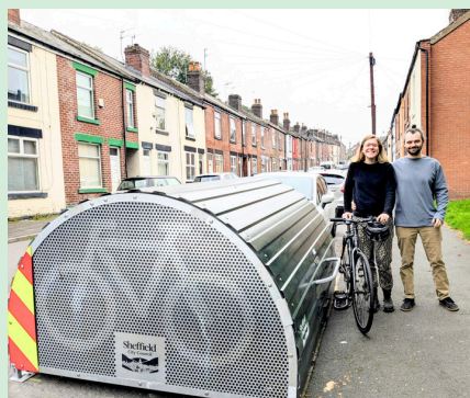
Residents at the first cycle hangar in Woodseats on Ulverston Road

Let us know your thoughts by using the contact details below.