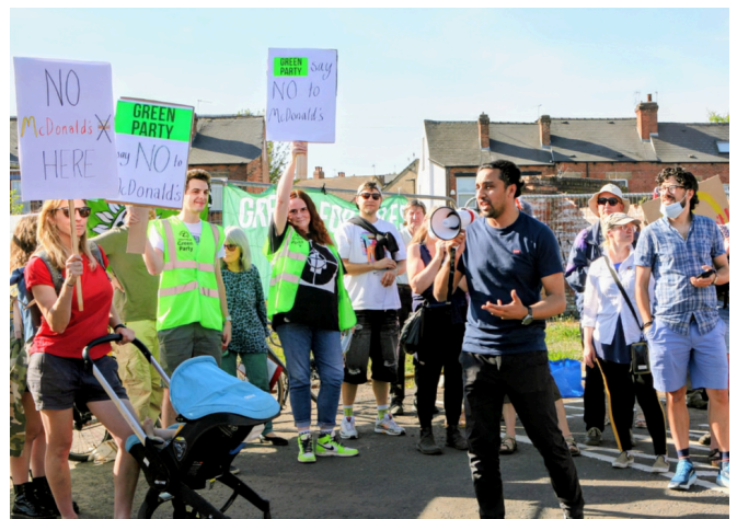
Greens supporting a community protest against a new McDonalds at Broadfield Road.

The new application raises the same concerns. Greens are supporting residents by highlighting local concerns about increased pollution near the school, health issues in the area and the detrimental effect on independent businesses.