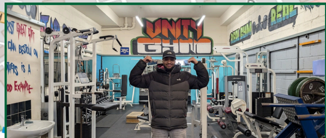
Funded Unity Gym Project helping young people with physical and mental health issues

Helped organise a Christmas event for children at St Andrews Church, Hanover