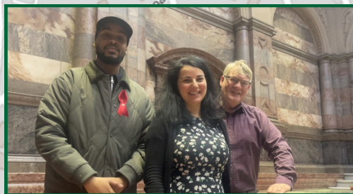
Supported residents against rogue landlords, making sure statutory duties were met

Maleiki says: "I work with tenants, visiting homes and following up concerns when families struggle to navigate the system."