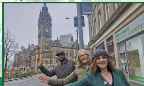
Called for free bus travel for under 22's in Sheffield in Council motion