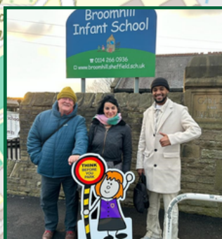
Supported safety camera scheme for Broomhill Infant School

Organised collection and contributed ward funds to S6 Foodbank