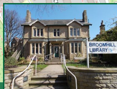
Helped fund wellness sessions at Broomhill Library