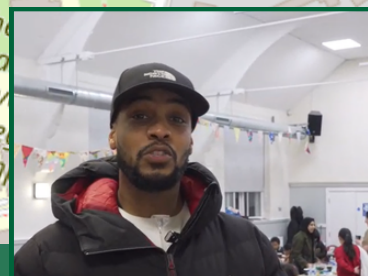
Supported children's Iftar (breaking of fast during Ramadan) at the Broomhill Centre

Organised summer and autumn Children Activity Days in Gell Street Park