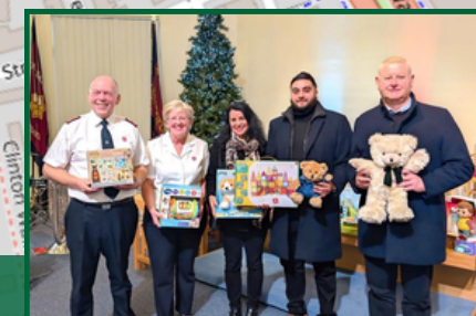
Supported Christmas Toy collection at Salvation Army

Map © OpenStreetMap.org contributors, data available under Open Database License (opendatacommons.org)