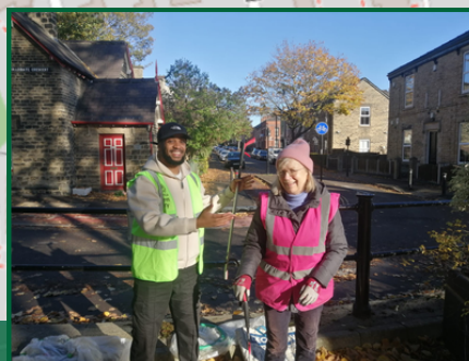
Reported large amounts of fly tipping and pushed for it to be cleared

Tackled rat infestations by working on long-term prevention measures