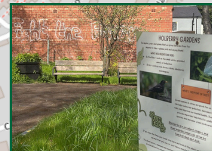
Boosted biodiversity in the ward by funding Broomhill HERB street gardening project