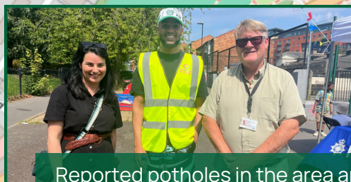
Reported potholes in the area and put pressure on Amey to do repairs

Maleiki says: "I work with tenants, visiting homes and following up concerns when families struggle to navigate the system."