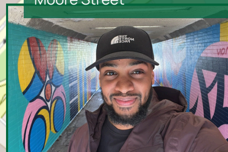
Supported residents following the Hanover maisonettes block fire and raised concerns about rehousing

Funded mural in underpass between Ecclesall Road and Moore Street