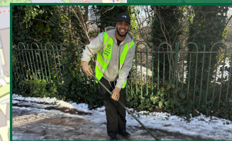
Organised gritting of roads during icy weather