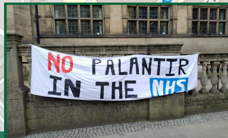
Took part in meetings to keep controversial AI company Palantir out of the NHS

Funded mural in underpass between Ecclesall Road and Moore Street