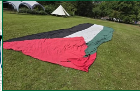
Nether Edge and Sharrow Greens supported the Small Park Big Run - a fundraiser in solidarity with the people of Palestine.