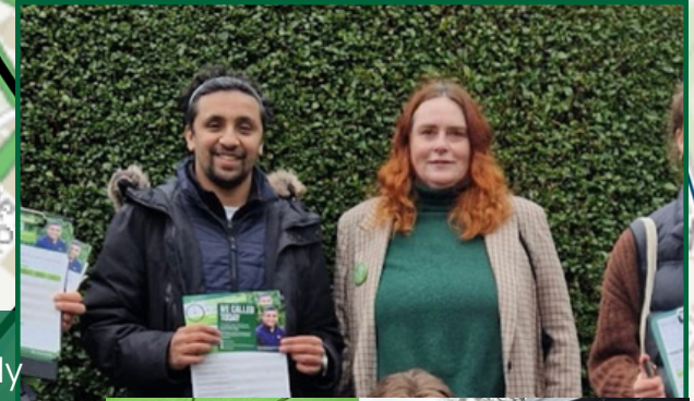
Organised weekly door-knocking sessions where I listened to residents struggles with the Cost of Living crisis.