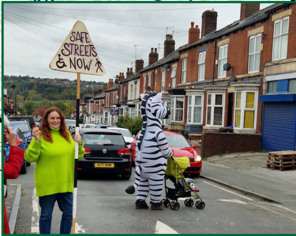
Supported the South West Living Streets campaign to demand a safer crossing in Vincent Road.