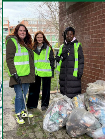
Coordinated regular litter-picking sessions around the Nether-Edge & Sharrow ward.