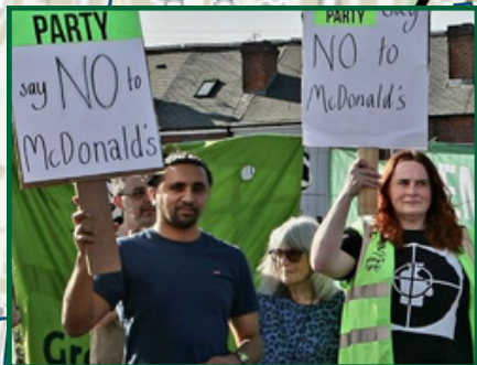
Organised two protests against the possible development of McDonalds, in support of Nether Edge and Sharrow communities and the people of Gaza.